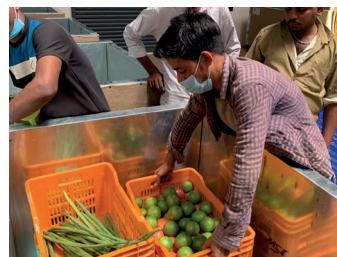
SSOPCL Subjee-Cooler deployment