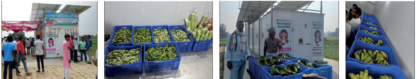
Singhwara PVCS, Darbhanga, Bihar

AEEE provides technical assistance to the PVCS and is monitoring the cold room to assess its effectiveness and energy performance.