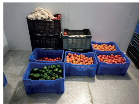
Harlakhi PVCS, Madhubani, Bihar